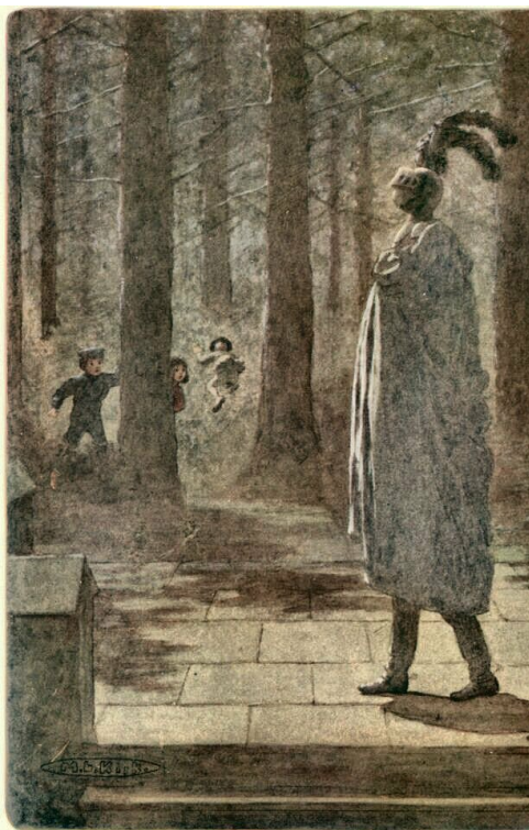
BEFORE FOLLOWING HER BROTHER SHE WANTED TO SEE EXACTLY WHAT THE LOOKED LIKE